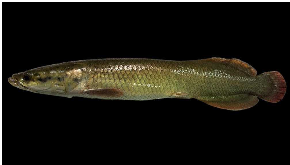
Figure 1. Lateral view of specimen of Arapaima gigas (Schinz, 1822). Scale bar = 10 cm.