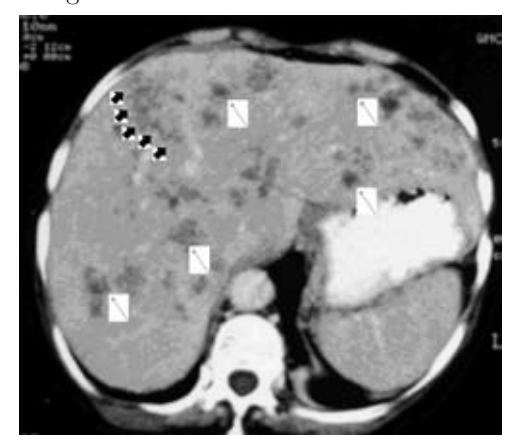
Figure 1. Lesions are more central than subcapsular. Case with CT scan after endovenous contrast showing nodular images (arrows), perivascular, some serpiginous (arrowhead), track-like and subcapsular-peripheral lesions = Pathognomonic of fascioliasis. Most lesions are central, scattered throughout the liver parenchyma. Splenomegaly is present. *With permission of Marcos et al. , 2008.

The aim of this review is to update the knowledge in fascioliasis in Peru, based on the most recent studies about epidemiology, diagnostic tools, treatment and we propose a novel clinical classification according to the stage of the disease.